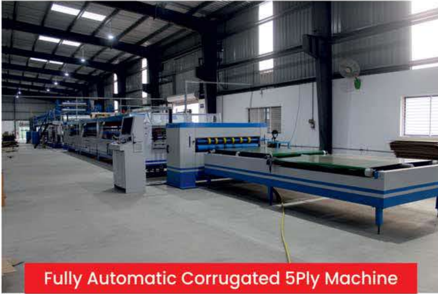
Fully Automatic Corrugated 5Ply Machine