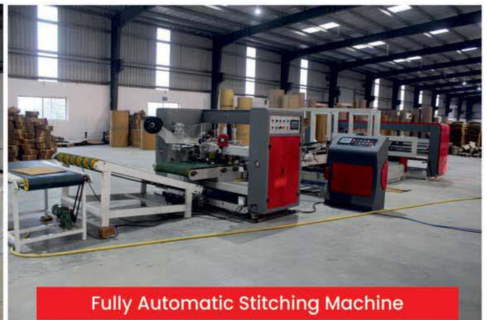
Fully Automatic Stitching Machine