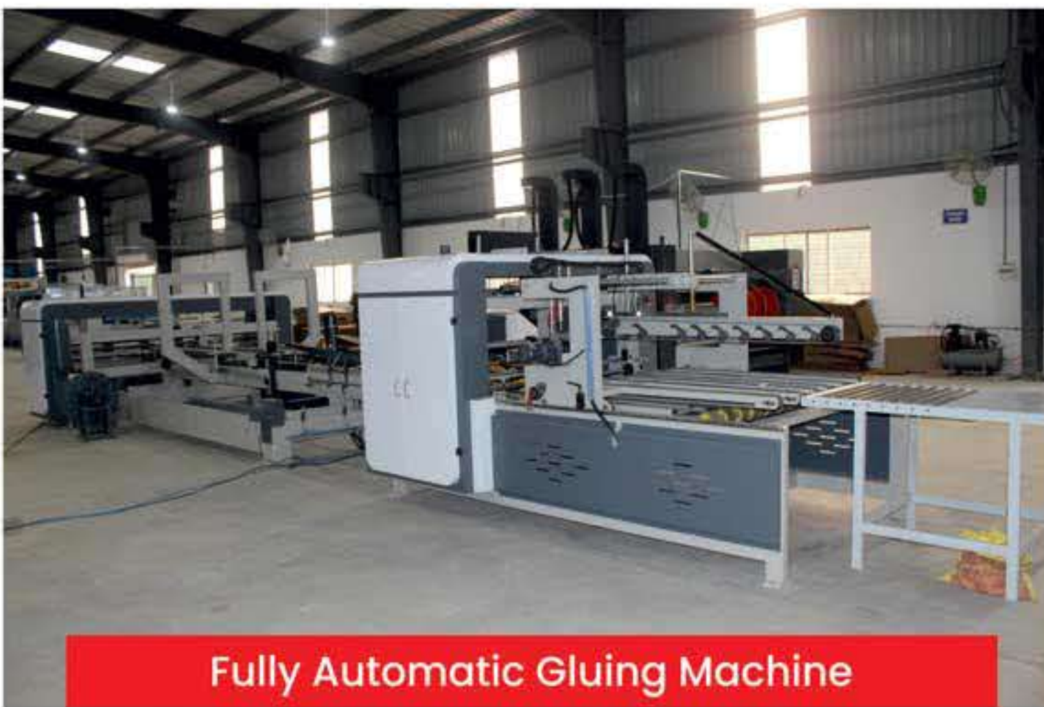
Fully Automatic Gluing Machine