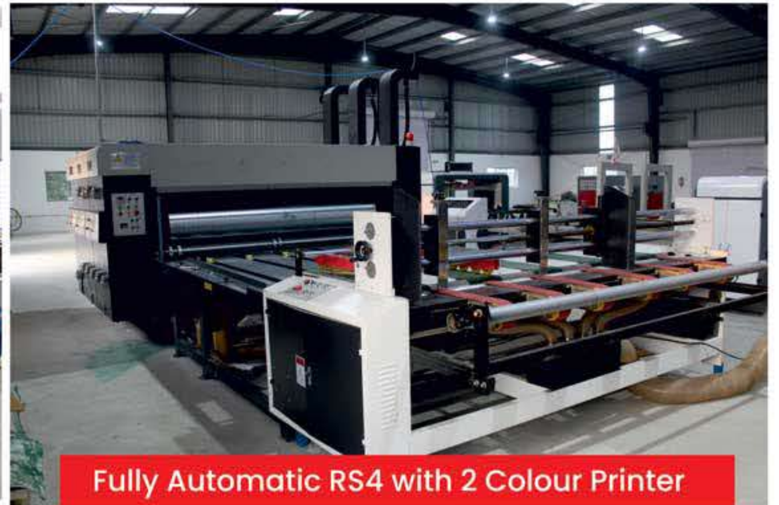
Fully Automatic RS4 with 2 Colour Printer